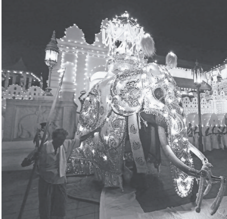
Esala Perahera, a Buddhist festival, is held in July and August in the city of Kandy.

The embassy at this important day, invites Japanese nationals to visit Sri Lanka, which offers amazing opportunities.