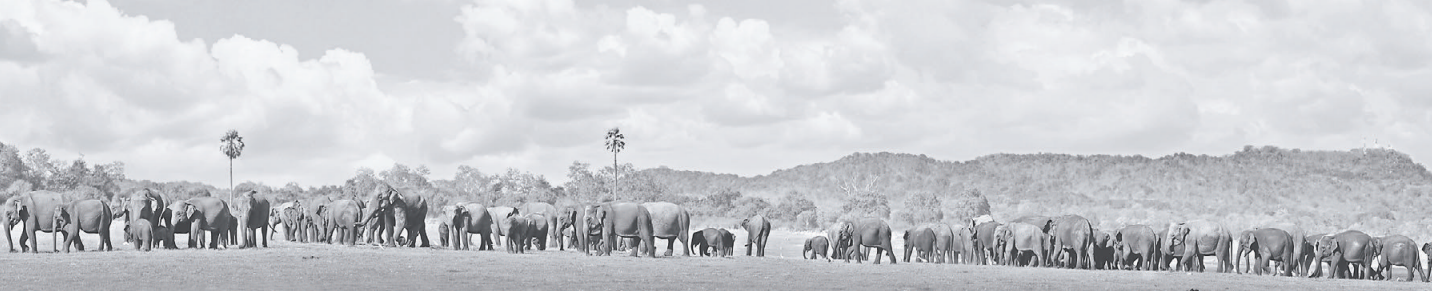
Wild elephants at Minneriya National Park in Hingurakgoda.

This manifesto was provided by the Embassy of Sri Lanka.