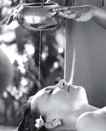
Ayurveda is a popular treatment in Sri Lanka.

our people, especially our youth. It is my belief and expectation that people from all ethnic groups and religions living in this country will come together as one, to participate in the task of taking Sri Lanka forward into an era of prosperity.