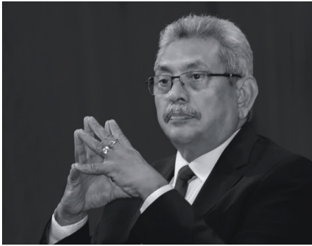
President of Sri Lanka Gotabaya Rajapaksa

President Gotabaya Rajapaksa said in his manifesto: "What we need at this hour is correct vision and unshakeable leadership. I thank you for entrusting me with the task of overcoming the challenges our country faces and leading our motherland toward peace and prosperity. This journey is being undertaken under the guidance of a proven leader, Mahinda Rajapaksa. His wisdom and experience will be a great source of strength to us, in this national endeavour. I strongly believe